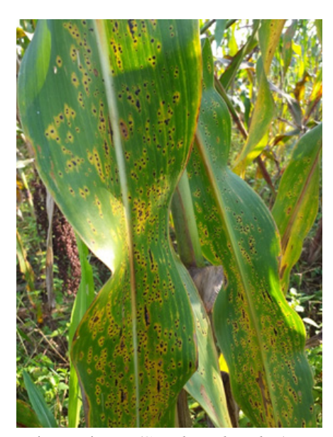
Figure 1. Tar spot of sorghum plants (Sorghum bicolor) caused by Phyllachora sp.

as on stems. Fruiting bodies on the leaves and parts of this plant are the source of inoculum for the next plantation, especially sorghum, which has a close relationship with maize.