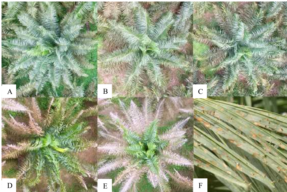
Figure 1. Aerial photographs of bagworm P. pendula attacks in various attack categories. (A) unattacked palm (score 0); (B) palms with mild symptoms (score 1); (C) palms with moderate symptoms (score 2); (D) palms with severe symptoms (score 3); (E) palms with very severe symptoms (score 4); (F) P. pendula attacks cause damage to the leaf epidermis.