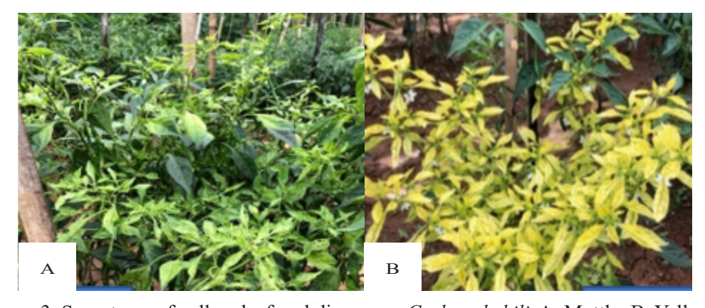
Figure 3. Symptoms of yellow leaf curl disease on Curly red chili. A. Mottle; B. Yellowing.