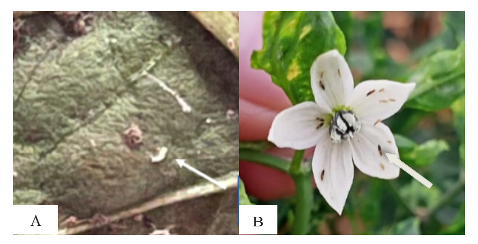
Figure 2. Viral infections are transmitted. A. Bemisia tabaci; B. Thrips sp.

Growth Observation. The dosage of tobacco leaf extract at 4 mL/L resulted in significantly different plant height, number of leaves, number of fruits, and fruit weight compared to 0 mL/L, 1 mL/L, 2 mL/L and 3 mL/L (Table 3). Potassium content in tobacco extract is elastic and hard, rich in oil, and plays a role in increasing cell elongation (Iqbal et al., 2017; Hu et al. 2019). Research conducted by Cheng et al. (2021) showed that increasing nicotine also increases soluble starch, soluble protein, vitamin C, cellulose, free amino acids, total phenolics, choline, total flavonoids, and procyanidin. The increase in these compounds contributes to plant growth (Jassbi et al., 2017; Zou et al., 2021). Additionally, tobacco extract increases the NPK element in plant tissues, thereby