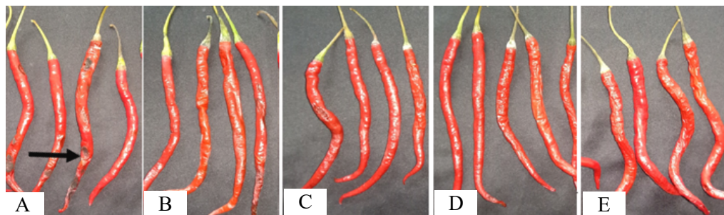
Figure 2. Representative anthracnose symptoms on red chili peppers sprayed with turmeric extract, observed six days after application. Disease severity decreases with increasing concentration of the extract. The arrow indicates the symptom of the disease. A. 0%; B. 1%; C. 2%; D. 3%; E. 4%.

Means with the same letter in a column are not significantly different ( p= 0.05 ) based on the LSD (Least Significant Difference) test.