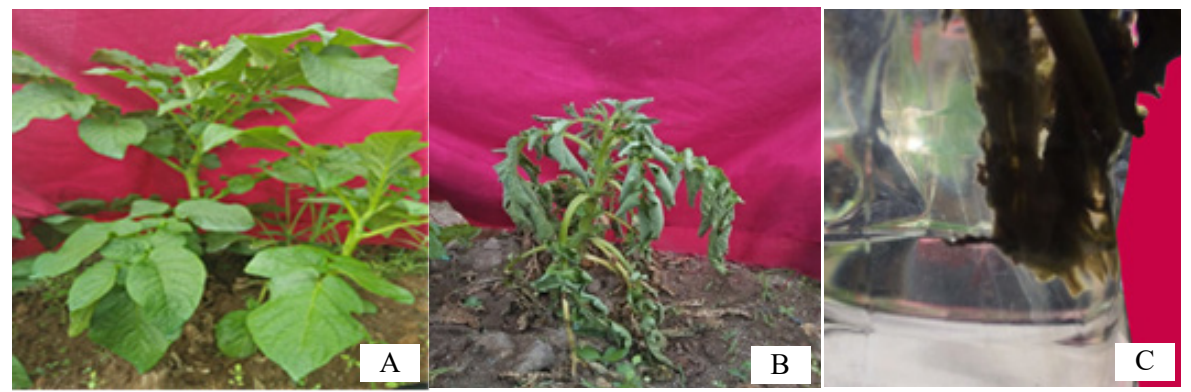
Figure 1. Symptoms of bacterial wilt disease at the observation site. (A) Asymptomatic; (B) Symptoms with plant wilting followed by leaves rolling down; (C) Bacterial ooze from the stems of symptomatic plants.

Incidence of Bacterial Wilt Disease. The percentage of disease incidence from nine locations can be seen in Table 1. The variety of percentage of disease incidences