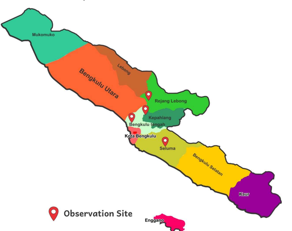
Figure 1. Sampling location in Bengkulu to collect papaya-infected virus; Rejang Lebong, Kepahiang, Bengkulu Tengah and Seluma District.

Synthesis of cDNA. The reverse transcription reaction was carried out with a total reaction consisting of 1 \mu l of total RNA, 1 \mu L of Oligo d(T) 50 \mu M, 1 \mu L of dNTP mix 10 mM, and 16 \mu L nuclease free water. The mix incubated at 65 °C for 5 min on waterbath, then chilled