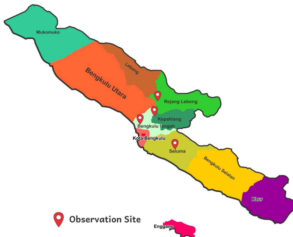
Figure 1. Sampling location in Bengkulu to collect papaya-infected virus; Rejang Lebong, Kepahiang, Bengkulu Tengah and Seluma District.

Synthesis of cDNA. The reverse transcription reaction was carried out with a total reaction consisting of 1 µl of total RNA, 1 µL of Oligo d(T) 50 µM, 1 µL of dNTP mix 10 mM, and 16 µL nuclease free water. The mix incubated at 65 °C for 5 min on waterbath, then chilled