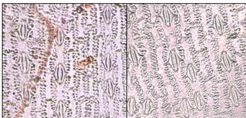
Figure 2. Appearance of stomata of accessions of maize germplasm (A) low density; (B) moderate density, observed under microscope.

An advanced test by linear regression test to find out each other influences of both variables showed that every increment in stomata density causes increase in rust disease severity to 0.73% (Figure 3). It was by reason of stomata roles as a path of penetration of obligate pathogens, such as rust disease-causing