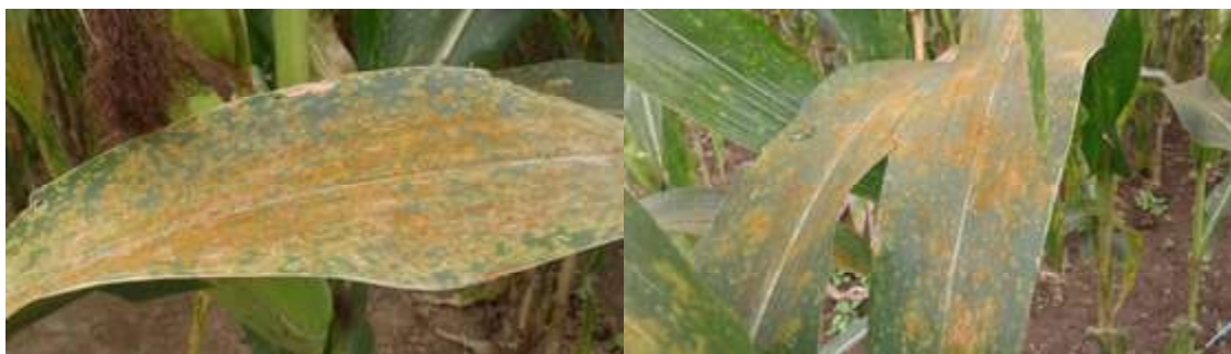
Figure 1. The symptom of rust on maize

Accession of maize germplasm with highest density of stomata is the one with number 173, and it is significantly different higher than stomata density of both control varieties (Figure 2). Some other accessions have value of stomata density that are not significantly different to the same value of susceptible comparison variety (Table 3). Table 3 showed that rust severity of some accessions were significantly different to those on Bima 10 variety that had also significant difference of stomata density. It indicated that the factor of stomata density influenced the infection level of rust disease on maize plants. Baswarsiati (1994) stated that the higher